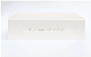
SATIN WHITE WAXY NUETRAL OPAQUE