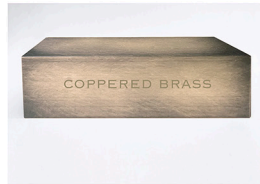
COPPERED BRASS BLENDED PATINA, LIGHT VALUE - BLUSH, GOLD, RAW UMBER