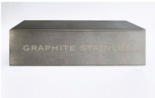
GRAPHITE SILVER TO GRAY, BRUSHED TRANSLUCENT