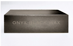
ONYX WAX WAXY GRAY-BLACK, BURNISHED SEMI-TRANSLUCENT