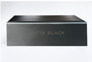
SATIN BLACK WAXY DEEP BLACK OPAQUE