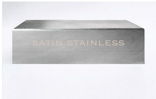
SATIN NO PATINA, BURNISHED