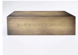
BURNISHED BRASS BLENDED PATINA, LIGHT VALUE - YELLOW GOLD, RAW UMBER