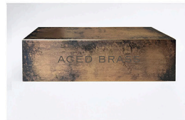
AGED BRASS MOTTLED PATINA, HIGH CONTRAST - GOLD, COPPER, BLUSH, DARK UMBER