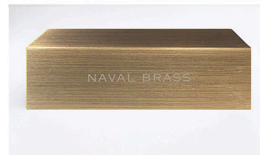
NAVAL BRASS BRUSHED PATINA, MIDDLE VALUE -YELLOW-GOLD, RAW UMBER