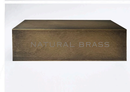
NATURAL BRASS BLENDED PATINA, MIDDLE VALUE -GREEN-GOLD, RAW UMBER