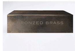
BRONZED BRASS SOLID PATINA, DARK VALUE - BLACK, UMBER, MUTED GOLD, HINTS OF COPPER AND BLUE-VIOLET